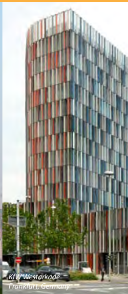
KfW Westarkade Frankfurt, Germany