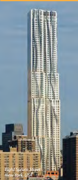
Eight Spruce Street New York, USA

Earn up to 3 hours Continuing Education Credits!