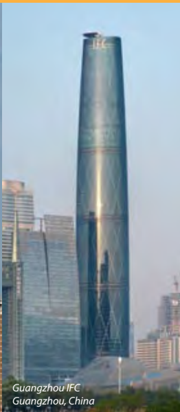
Guangzhou IFC Guangzhou, China