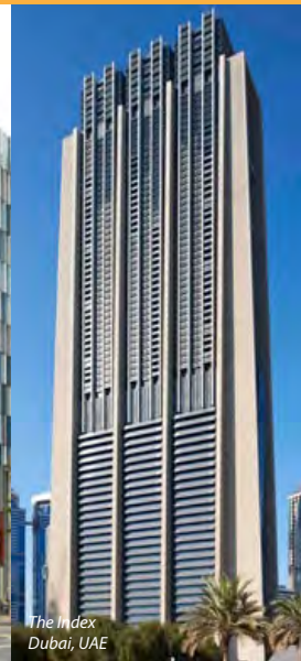
The Index Dubai, UAE